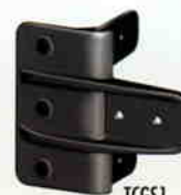
VINYL (PVC) GATES